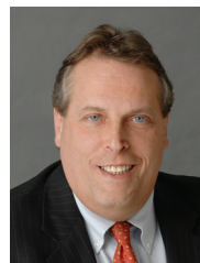
Pierre Nanterme Chief Executive Officer Accenture