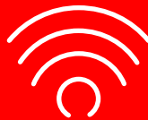
IN-STORE WIRELESS DEVICES / FREE WI-FI