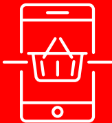
PERSONAL SHOPPER APPS