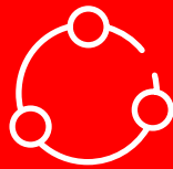
SOCIAL NETWORKING PLATFORMS