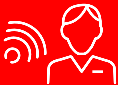
DIGITAL TOOLS TO CONNECT WITH STORE ASSOCIATES