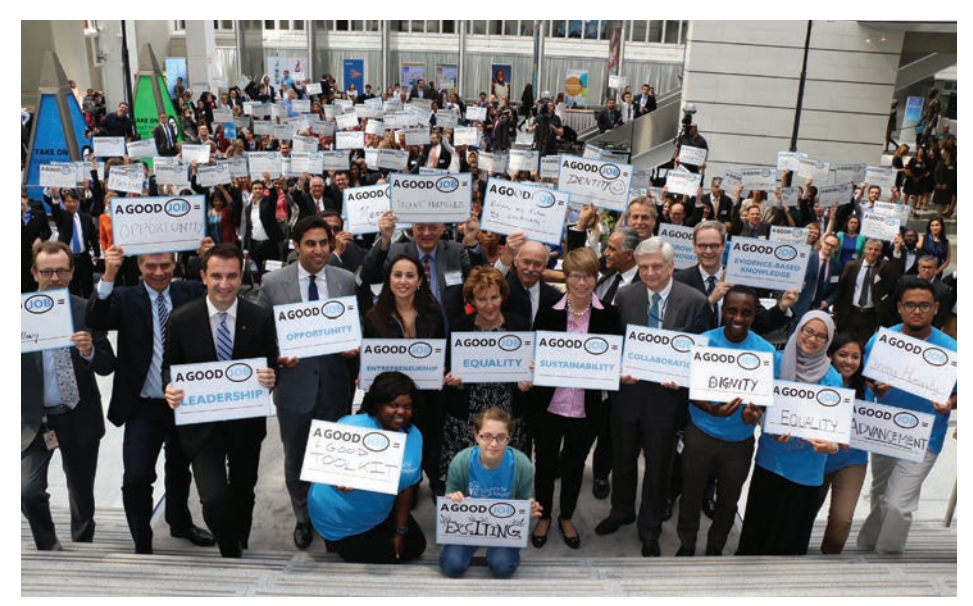
Attendees at the launch for the Solutions for Youth Employment coalition share what "a good job" means to them.

• We are the private-sector founding partner of <u>Solutions for Youth</u> <u>Employment</u>, a global coalition launched in 2014 in collaboration with the World Bank Group, International Youth Foundation, the RAND Corporation and our nonprofit partners Plan International and Youth Business International. Together, we are convening governments, businesses and civil society to identify new insights and scale proven solutions for increasing the number of young people engaged in productive work.