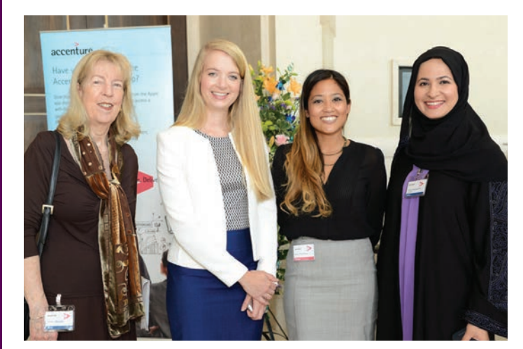
In fiscal 2014, as part of International Women's Day, Accenture women celebrated in Abu Dhabi and at events around the world.