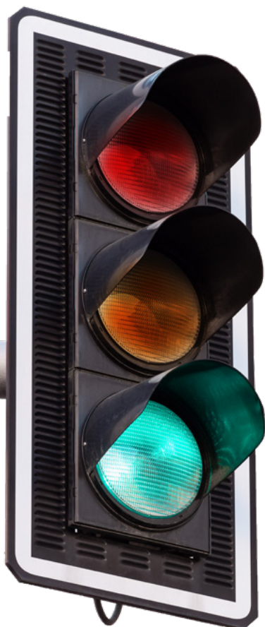
Figure 3: Modified “traffic light” approach

PLA test failure consequences: As per the January 2016 standard, trading desks that fail the PLA test will not be eligible to use the IMA and will be subject to use the standardised approach, which results in a significant increase in capital requirements. To address concerns over volatility in capital requirements, the BCBS proposed a modified “traffic light” approach to smoothen a trading desk’s transition to the standardised approach.