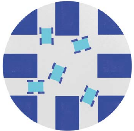
We use real data to simulate how robots are likely to perform in a workspace.

Our approach means focusing on a specific sub-set of the entire space, which we then plug into the bigger picture. This technology allows us to design the optimal workspace for both robot and human alike.