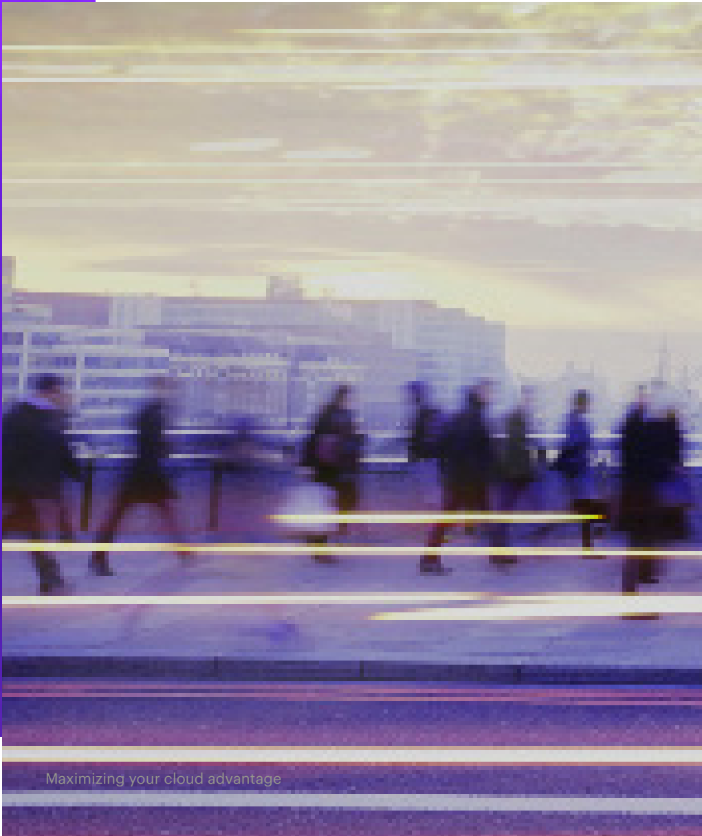
Maximizing your cloud advantage