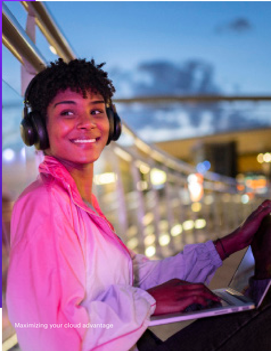
Maximizing your cloud advantage