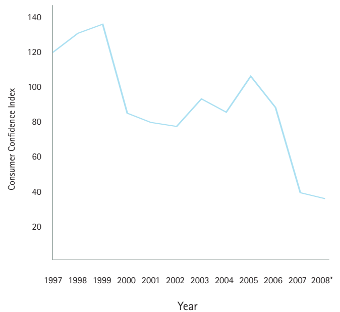
Consumer confidence in the United States

* Each year's data is for the month of December; 2008 data is for October