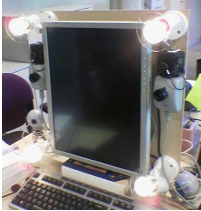
Figure 2. Inside the first prototype of the Persuasive Mirror.

with Active Appearance Models [18][19] that have proved to give good results not to only localizing the head on the image but also determining where the facial features are.